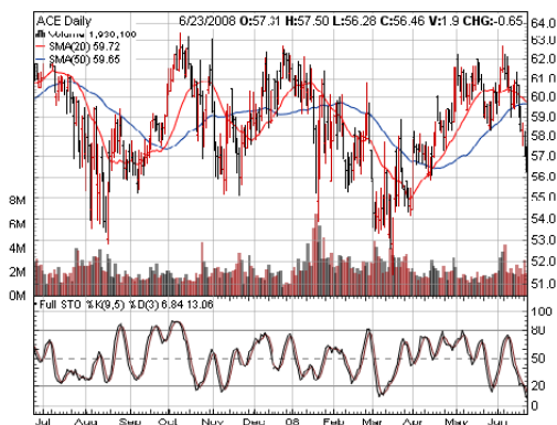
Figure 2: Bollinger band crossover BSRCTB (Combinatorial Algorithm)

The following figure explains the Bollinger band crossover of the sample data